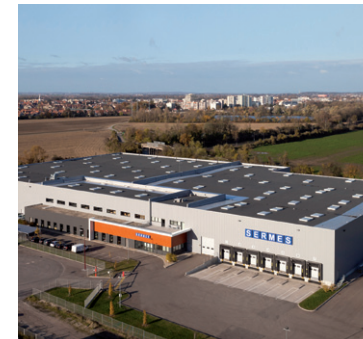
Motor drives, logistics centre