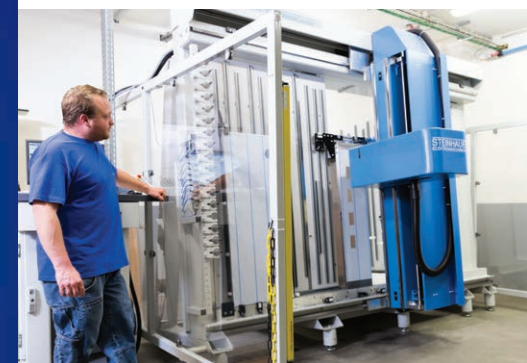
Machining centre for boxes and cabinets