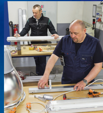
Lighting channel pre-assembly

Our integrated workshops are also available for making any modifications and adaptations to achieve the required technical configuration.