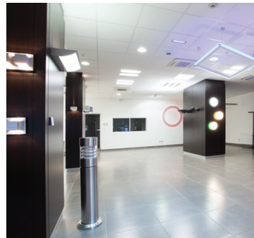
Lighting show room