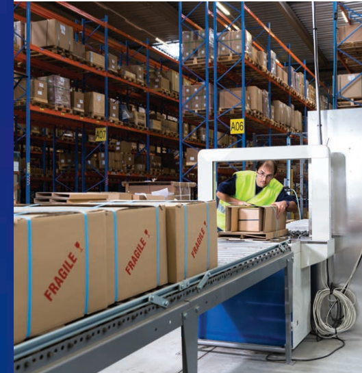
Packaging and shipment