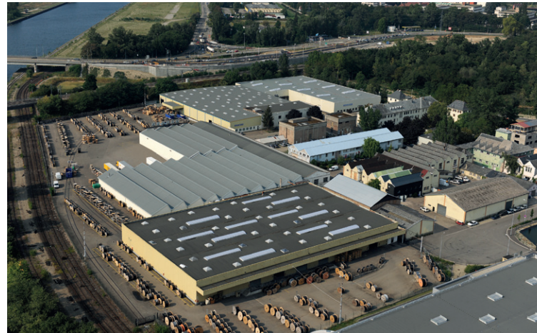
Cables logistics centre

Our disciplined yet flexible organisation demonstrates its efficiency with the 23,000 tonnes of goods and 110,000 parcels shipped every year.