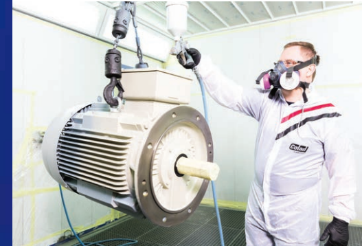
Motor Spray Booth